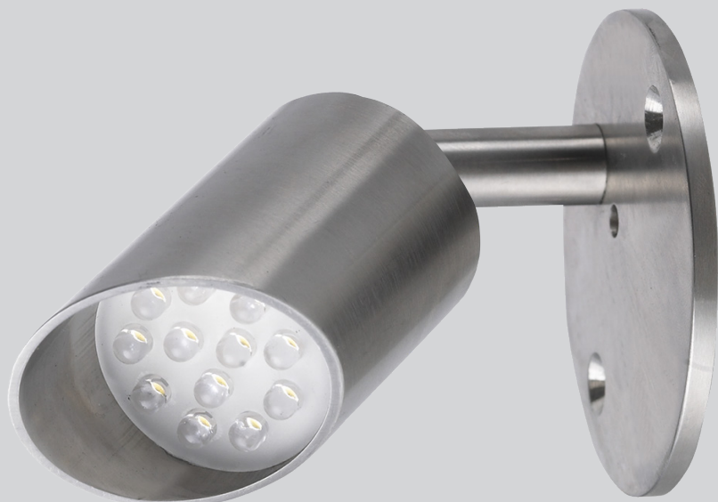
Model shown: LTWP12